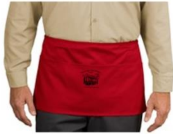
A515 in Red