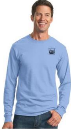
29LS in Light Blue