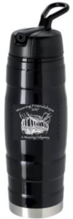
Water Bottle in Black