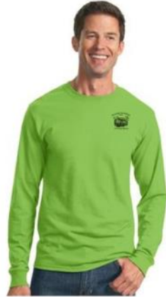
29LS in Kiwi