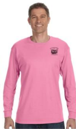
29LS in Azalea (Melon Pink)