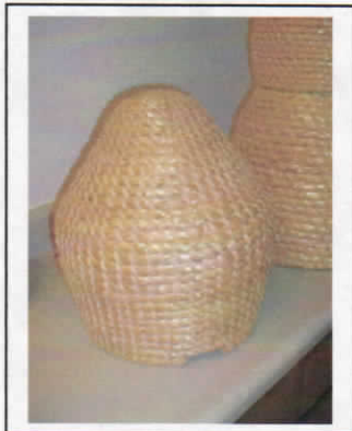
One of Mike's finished rye straw coiled baskets.