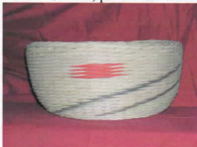
"Pathway to Courage" basket

Cost for class: $10.00, paid to the instructor.